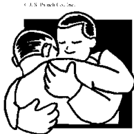
Oficio de Reconciliación

Para cumplir con el mandamiento de confesarse por lo menos una vez al año y para cumplir con el precepto pascual de comulgar, habra servicio penitencial de cuaresma, (confesiones) el día martes 4 de Abril a las 7:00 pm.